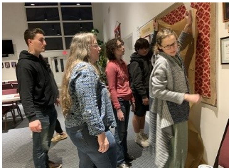
Creating the "Heroes" Bulletin Board